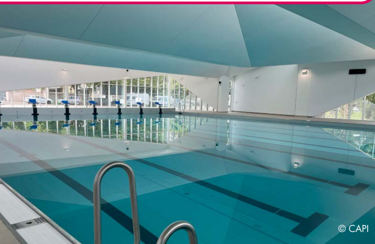
| Intercommunal swimming pool Alice Milliat in Bourgoin-Jallieu

More informations on www.piscine-global-europe.com