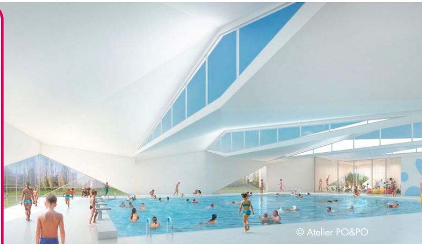
| Perspective of the new intercommunal swimming pool of Bourgoin-Jallieu

To find out more about this project, click here ( https://capi-agglo.fr/nos-grands-projets/la-future-piscine-capi/ )