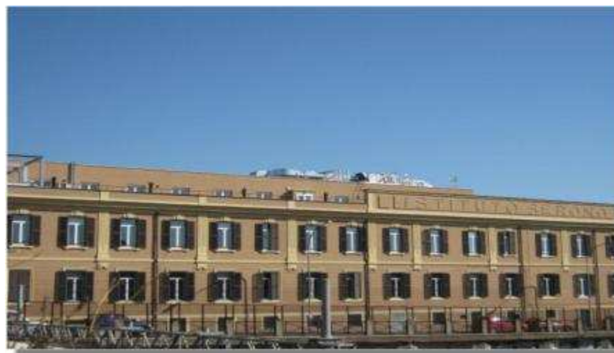
The building today