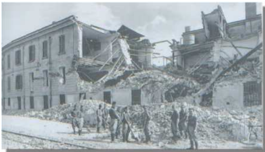
The building after the World War II

Within the historical building that once was Serono Pharmaceutical Company's headquarter, which has been totally refurbished to be converted into an Hotel of high standarding 144 guest rooms and different reception-meeting rooms to fulfill any kind of meeting needs, the Eurostars Roma Æterna is set in one of the fast growing quarters of Rome: Pigneto.